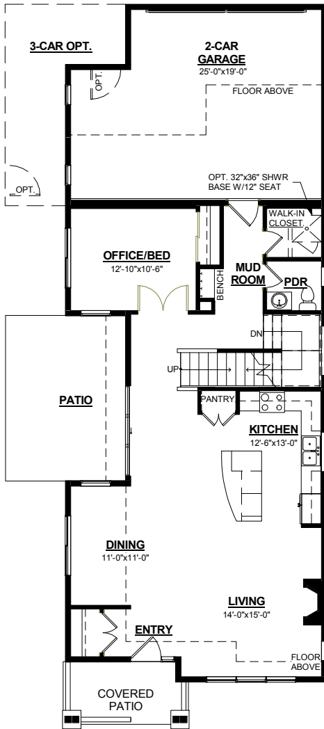
MAIN LEVEL FLOOR PLAN 1,126 SF

Finished Sq. Ft. 2291 Total Sq. Ft. 3422